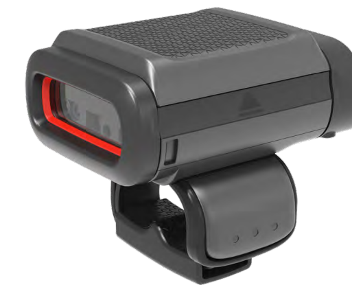
8680I Wearable workflow device for simple, frequently repeated workflows