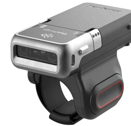
8675I Compact, lightweight, rugged wearable Bluetooth scanner

to the host, significantly enhancing the process of picking, sorting, put-away, and packing. Designed specifically for high-volume operations such as postal and parcel workflows, these scanners maximize efficiency and streamline operations, ultimately contributing to overall operational success, while providing an agile solution tailored to industry needs