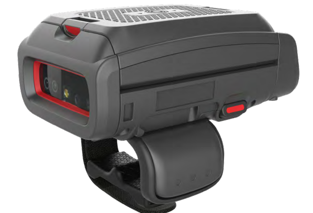
8690I Wearable workflow device for simple, frequently repeated, RFID-enabled workflows