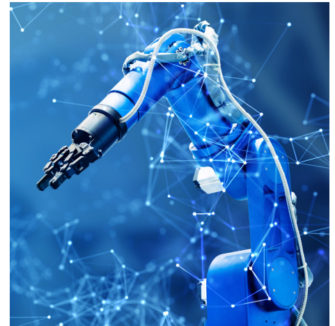
Figure 1. Industrial Robotics