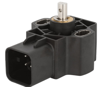
RTY Dual-Output Hall-effect Sensor