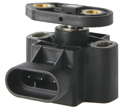
RTY Hall-effect Sensor

Hall-effect sensors are known for their robustness and resistance to environmental factors such as dust, dirt, and moisture. They can perform well in harsh conditions, making them ideal for industrial applications.