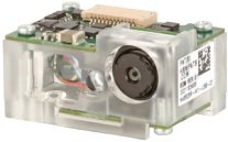
DECODED N4680 Series

Our patented technology can read low quality barcodes due to damage, distortion, poor contrast or challenging package shapes and materials. With near and far reading ranges, compact dimensions, enhanced motion tolerance, a wide temperature range and power efficiency baked in, our high performance ultra-slim series is perfect for mobile designs. Whatever your application requirements, we have a product to help.