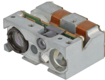
EXTRA LONG RANGE Extended FlexRange™ Series

Our engines provide high performance and reliability, increased scanning speeds and simple integration.