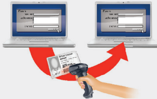
Automatically populate electronic forms in a single scan.

For a complete listing of all compliance approvals and certifications, please visit www.honeywellaidc.com/compliance .