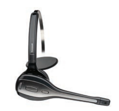
The Honeywell SRX-SL slim-line wireless headset brings the power of voice-directed work to small- to medium-sized businesses.

familiar platform, it also allows them to manage multiple interfaces — such as voice, scanning and keypads — alongside other mobile work applications.