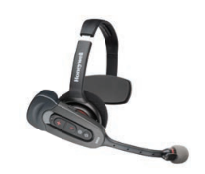
The SRX3 wireless headset raises the standard in mobile workforce efficiency, productivity and accuracy.