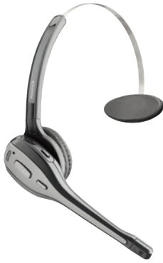
CT40 mobile computer with Honeywell Guided Voice application and SRX SL headset

» Click Here to learn How to Clean Honeywell's General-Purpose Scanners and Disinfectant-Ready Products