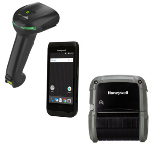
Xenon XP 1952-g-bf scanner, CT40 mobile computer and RP4e mobile printer

Switching to a curbside model allows for their shoppers to get the products they need while adhering to social distancing recommendations. 4