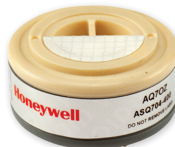
Sensor Part Number: ASQ704-400-ROW

The AQ7 Series are for environmental applications; other applications, including industrial safety, may not be suitable.