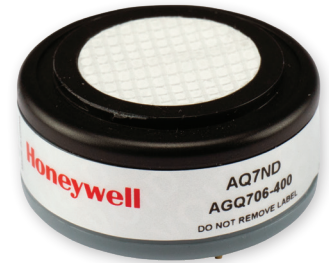
Sensor Part Number: AGQ706-400-ROW

The AQ7 Series are for environmental applications; other applications, including industrial safety, may not be suitable.