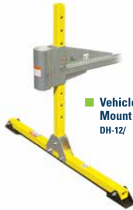
■ Vehicle Hitch Mount Sleeve DH-12/

Designed to install into a 2-in. (.05m) receiver on an attendant vehicle to provide a portable anchor point for confined space entry/retrieval, rescue and fall arrest applications.