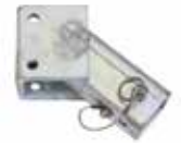
■ Single Direction Bumper Receiver DH-17/