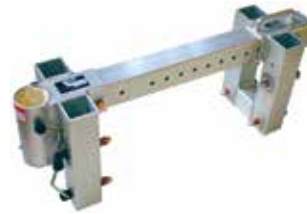
■ Adjustable Barrel Mount Sleeve DH-6/

Eight independent clamping screws allow temporary installations over edges of shoring cans, walls and other structures.