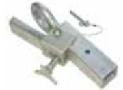
■ Pintle Hitch Adapter DH-15/