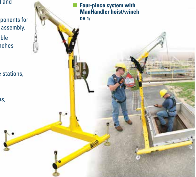
■ Four-piece system with ManHandler hoist/winch DH-1/