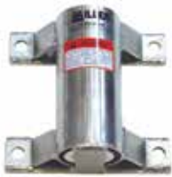
■ Wall Mount Sleeve DH-8ZP/ & DH-8SS/

Mounts to horizontal concrete or steel structures.