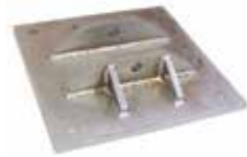
■ Bolt-on Anchor Plate For use in concrete or steel applications (Portable or Permanent) DH-AP-12/