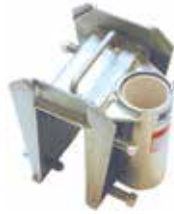
■ Barrel Mount Sleeve w/3.5-in. (.09m) Opening DH-5/

Three lightweight aluminum components for easy transport. Features adjustable aluminum screws and a built-in level indicator for easy set-up on uneven surfaces. No tools required for assembly.