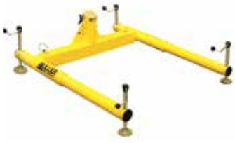
■ Three-Piece Portable Base DH-4/ – Maximum 29-in. (.74 m) offset DH-24 – Maximum 48-in. (1.22 m) offset

All of the following bases are compatible with all Adjustable Mast Options. All base options include PVC liner.