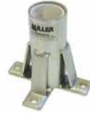
■ Floor Mount Sleeve DH-7ZP/ & DH-7SS/

Designed for shoring, wall and parapet applications where frequent set-up over varying wall thicknesses is required. Accommodates wall thicknesses up to a max. of 24-in. (.61m).