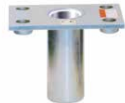
■ Flush Floor Mount Sleeve DH-20ZP/ & DH-20SS/

Designed for applications involving frequent set-ups over similarly-sized access openings. Simply slip collar into sewer manhole, tank hatch or other opening.