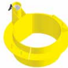
■ Manhole Collar DH-11/

Designed for slip-in installation into a 4-in. (.10m) diameter core hole in concrete or in an existing steel structure.