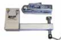
■ 2-in. (.05m) Ball Hitch Adapter DH-16/