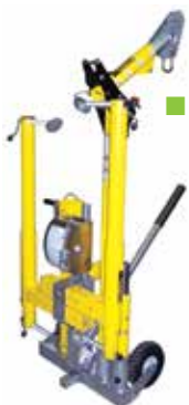
■ DuraHoist Equipment Cart DH-18/