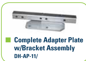
■ Complete Adapter Plate w/Bracket Assembly DH-AP-11/