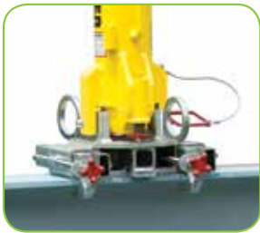
■ Portable I-beam Anchor Base Attaches to steel I-beams DH-AP-9/