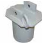
■ Plate for Inclined Surfaces w/Tie-off Anchor DH-AP-6/