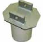
■ Plate for Inclined Surfaces DH-AP-7/