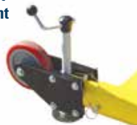
■ Wheel Kit for DuraHoist Three-Piece Base DH-4WK/