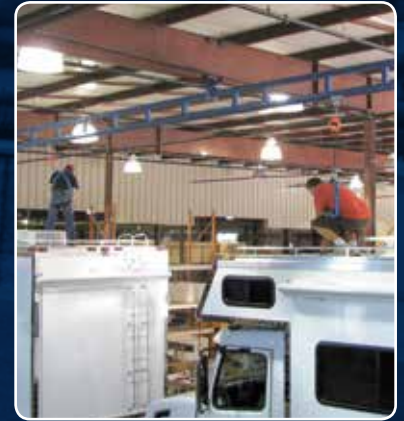
Track Type Rigid Rail System