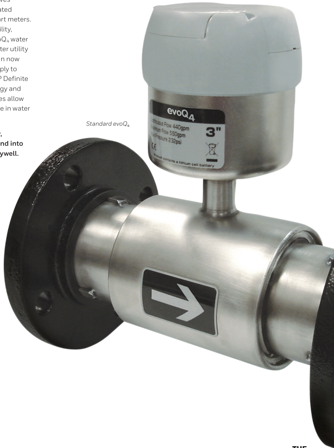
Standard evoQ 4

Managing water networks safely, effectively and efficiently now, and into the future, is possible with Honeywell.