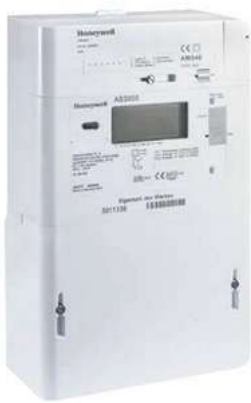
AS3000 Electricity Meter Connected to AM540 Communication Module