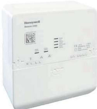
Beacon 3100 Data Concentrator